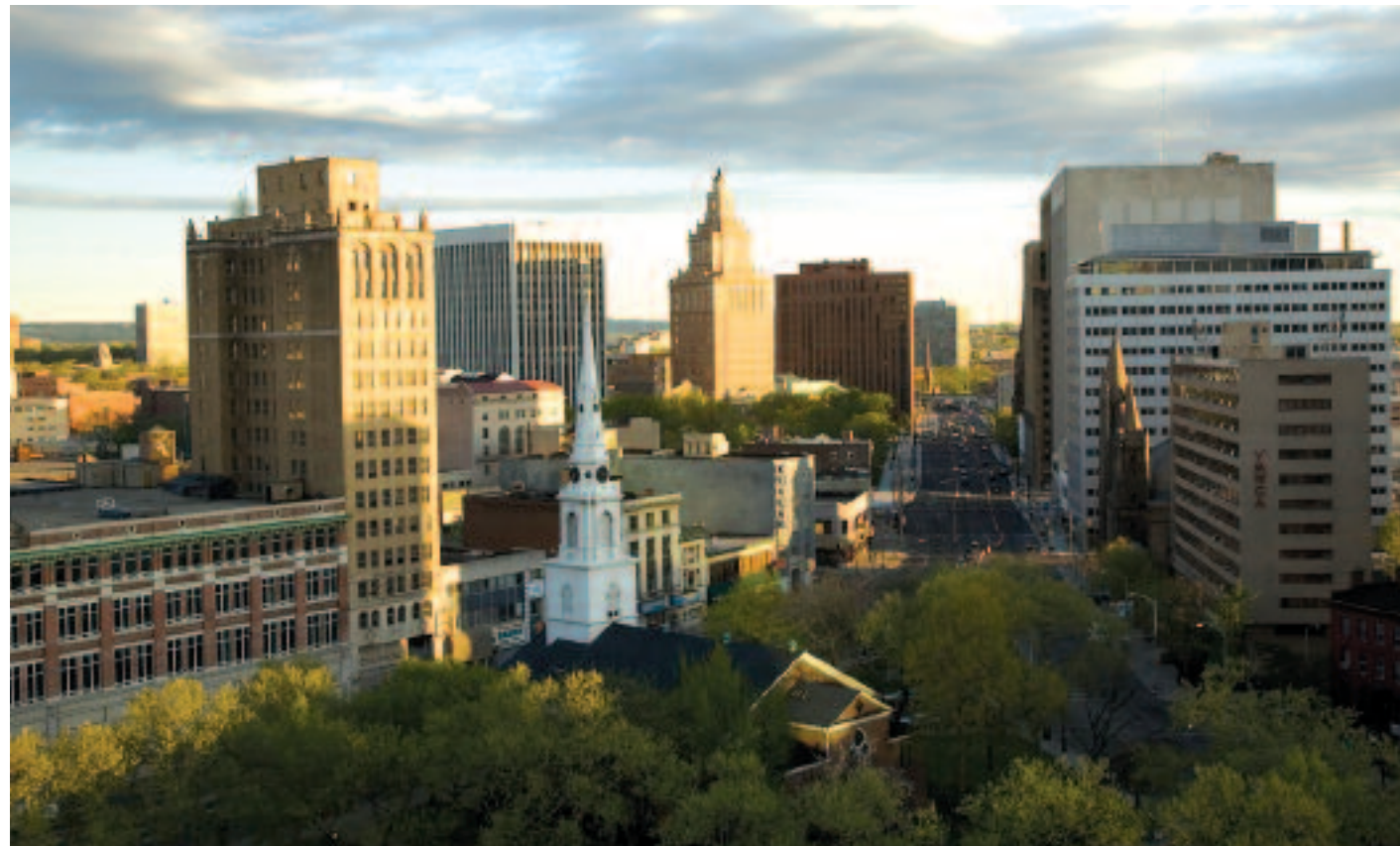
Newark's skyline continues to change and expand as more corporate offices, townhouses, restaurants and sports arenas go up.