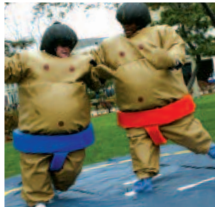
Stress relief and silliness on campus comes in all shapes and sizes.