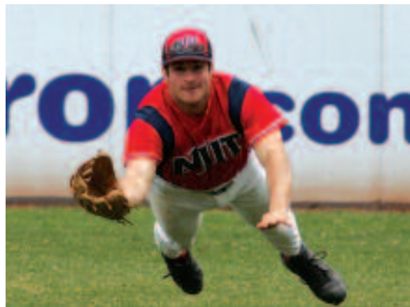
The NJIT baseball team plays all of its home games in the 6,200-seat Bears and Eagles Riverfront Stadium, home of the Highlanders and the minor league professional Newark Bears.

In 2007-08 NJIT hosted six basketball games in the inaugural year of the downtown Newark Prudential Center, home of the National Hockey League's New Jersey Devils, with plans to host more games in "The Rock."