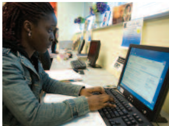
The Murray Center for Women in Technology offers a friendly, comfortable environment to work, socialize, or just relax.

NJIT has spent more than $83 million revamping, improving and adding new buildings. One of the newest buildings is the Campus Center, which now serves as a hub for students and faculty members. Here you can load up on caffeine at Starbucks, grab a snack, blow off steam in the game room or bowling alley, catch up with friends, study, nap, or go to a student organization meeting. Come crunch time before finals or midterms, there's likely to be free back massages or free snacks to get you through the long hours.