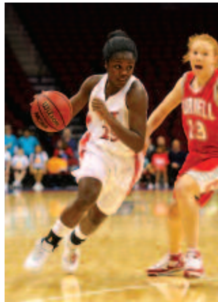
NJIT women's basketball more than doubled its wins total in 2007-08 over the previous season.