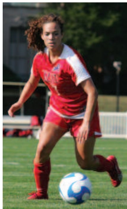
Women's soccer finished 4-1-1 in its last six contests of the 2007 season. The team plays on campus on Lubetkin Field, a lighted artificial turf field with seating for more than 1,000 spectators.