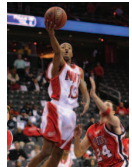
NJIT men's basketball hosted Rutgers (shown) in the downtown Newark Prudential Center in December. NJIT hosted six men's and women's games at "The Rock," home of the National Hockey League New Jersey Devils, in 2007-08.