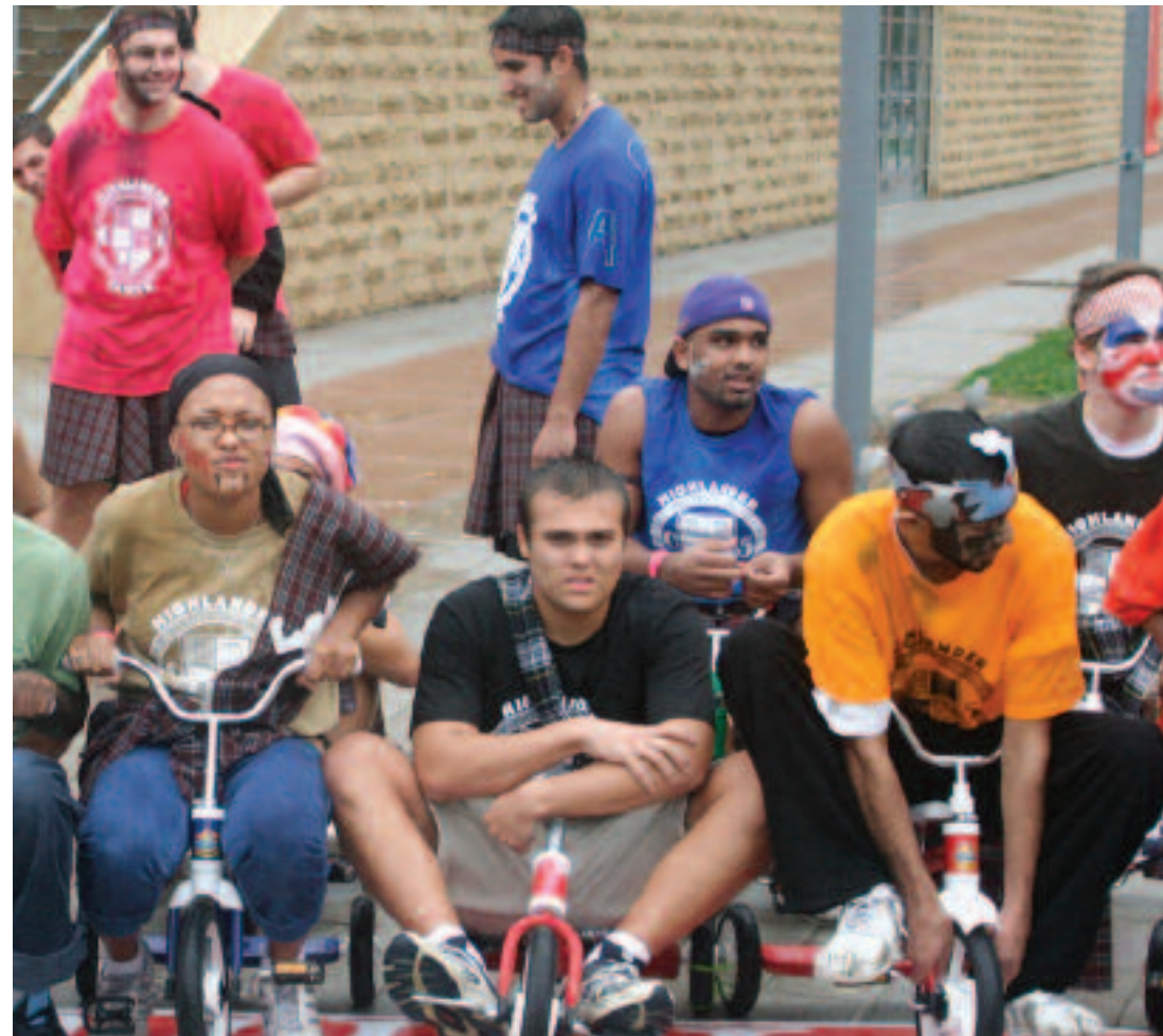
Tricycle races are just part of the fun during NJIT Day, when students compete in all kinds of zany contests and enjoy barbecues, soccer games and a battle of the bands.