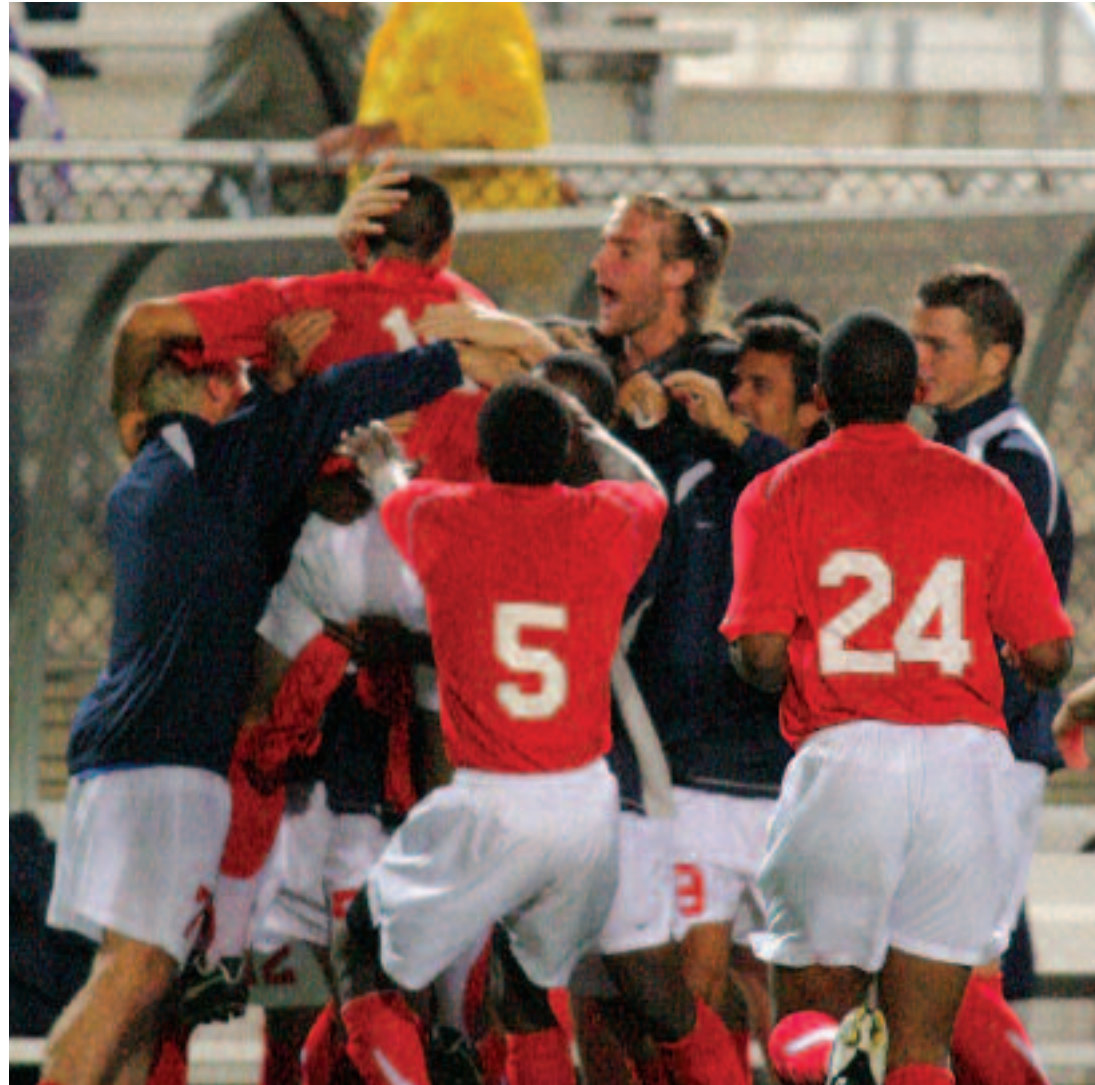
The Highlanders, who posted a win over nationally ranked San Diego State in San Diego in September 2007, play a top schedule. Here they are celebrating a goal that gave them a 1-0 lead against powerful Rutgers.