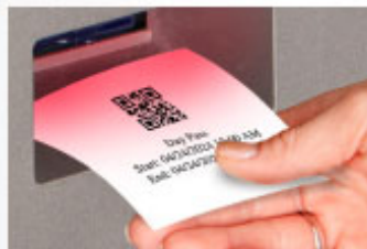
QR code voucher being used