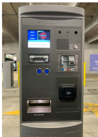
In-Lane Credit Card Payment Kiosk at STPG (42 Wilsey St) only