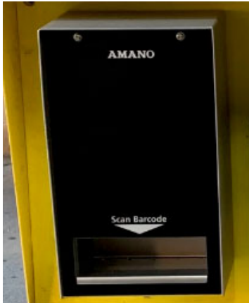
QR code Scanner at gate

Starting in the Fall of 2020, new QR code system scanners have been installed in the Science & Technology Park Garage – STPG (42 Wilsey St) and the Summit Street Parking Facility - PARK (154 Summit St). These scanners will read a QR code located on your voucher or handheld device and will open the gate for one entry of parking. This automated method will eliminate the need to interact with officers at the gate. Simply present the pre-purchased QR code to the scanner for entry.