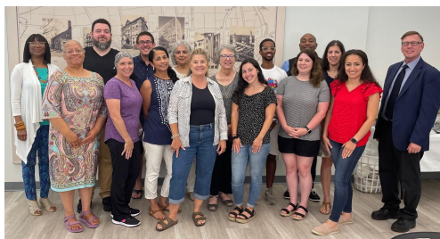
FSI Teachers Summer 2023