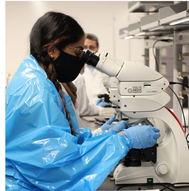
FSI in action

The Forensic Science Initiative Teacher Prep Program