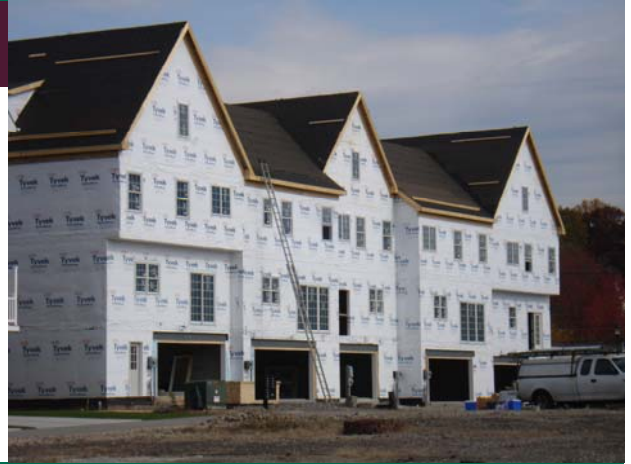
Edgewater at Oakmont Townhomes under construction.

As the largest planning area along Oakmont's riverfront, the former Edgewater Steel site encompassed two large, vacant lots. The Borough defined a vision to create a mixed use district consisting of residential, commercial, open space and light industrial land uses in 2005. In order to properly shape the development into the reality that the Borough envisioned for this area, Oakmont developed one of the Commonwealth's first form-based zoning ordinances. This brownfield redevelopment loan from the U.S. Environmental Protection Agency to assist in our efforts to transform the 35-acre former Edgewater Steel location in Oakmont into a residential community with townhouses and single-family residences that is seamlessly integrated into the fabric of the borough.