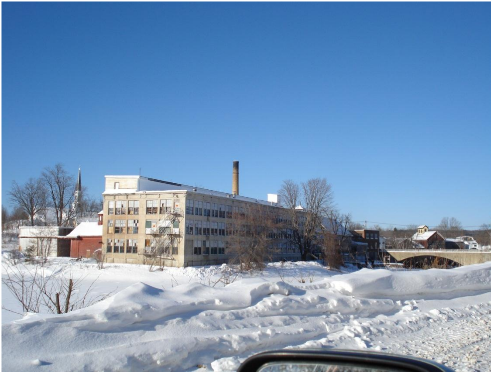
Mayo Mill in 2010, also known as Moosehead Manufacturing.