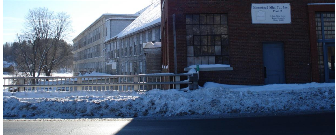
Mayo Mill from the bridge in 2010.