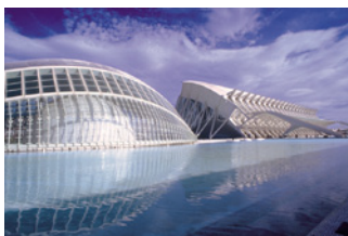
Valencia, Photos provided by TurisValencia ©TVCB